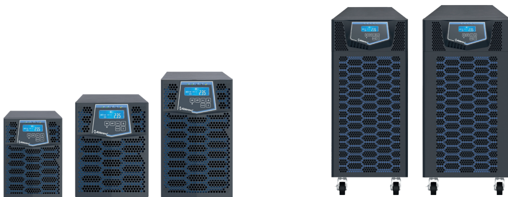
Ares 1000-3000 VA

Online UPS for maximum protection and longer uptime of critical devices for small, medium and large businesses